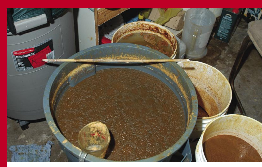
(Above is the toxic sludge from a meth lab busted in British Columbia)

The Meth production process has led to several deaths and many poisonings in the US.