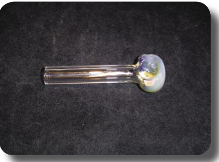
(Pipe used to smoke crystal meth)

This is a major reason why users become so addicted to the drug; without it they are no longer able to experience pleasure (a condition known as anhedonia),